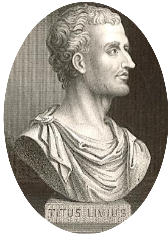
Titus Livius Patavinus