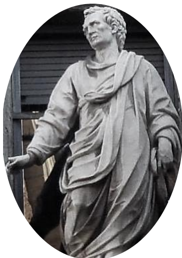
Decimus Maximus Ausonius