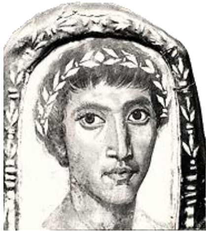
Gaius Valerius Catullus